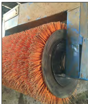
Too close to item ❌