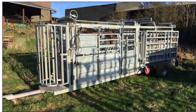
Right distance to see whole item ✅