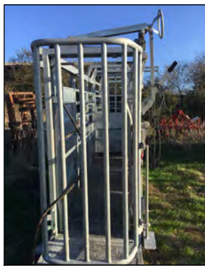
Can't see whole item ❌

Here is an example of what photographs should and shouldn't look like:-