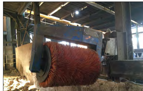
Right distance to see whole item ✅

The make and model has been removed from the photos as not to promote one supplier.