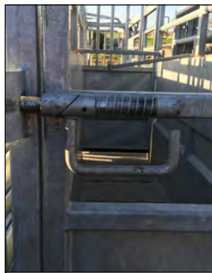
Too close to item ❌